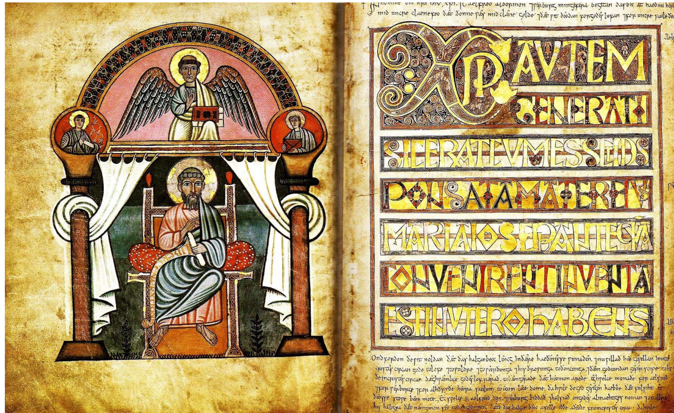
Bible : Codex Aureus Canterbury Matthew 1:18

Archaeologists have found copies of both editions of Mark's Gospel, which are distinguished by one edition